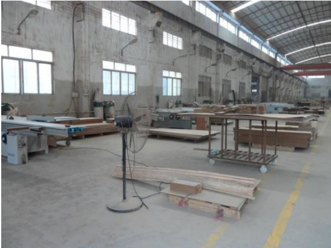
Raw Material cutting Area