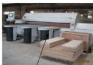
Computer control saw , solid wood saw, T-shape saw