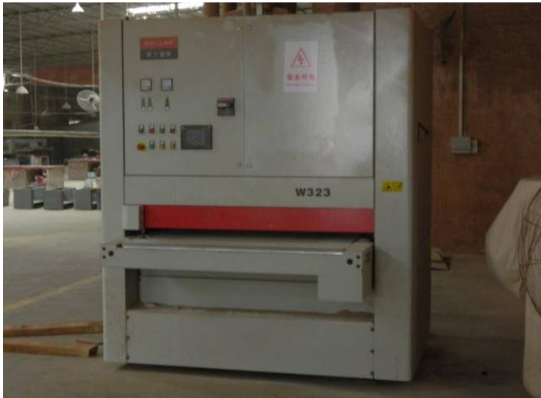
General view of wood working machines